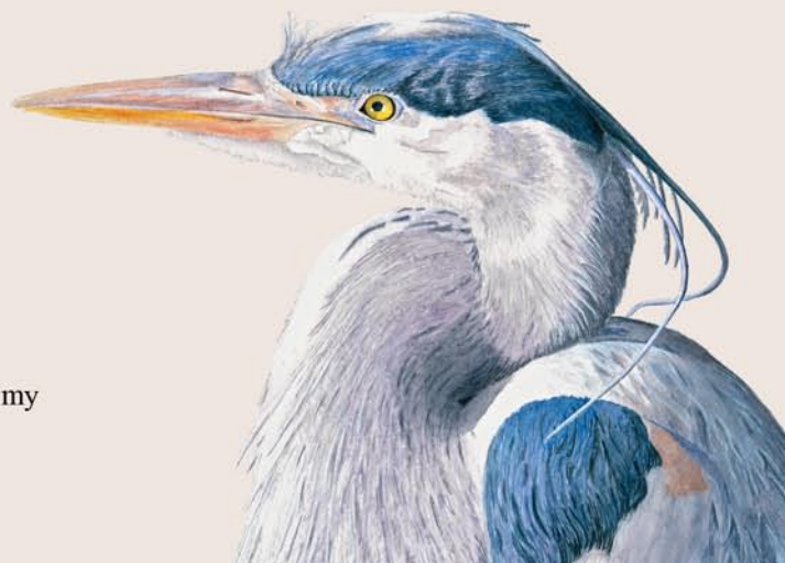
Ardea herodias Great Blue Heron watercolor